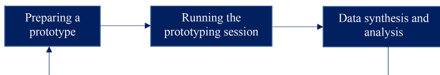
Figure 1. The prototyping loop