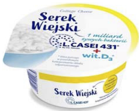
Figure 1. Example of a product picture used in Part A of a research questionnaire