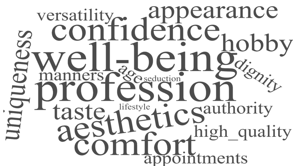
Fig. 3. Word cloud of respondents' keyword-reasons to choose elegant style (N = 167)

The reasons as to why the respondents chose a given style were classified into several recurring categories, which are presented in Figure 3.