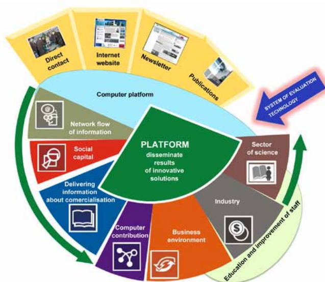
Picture 1. Organizational structure of the model technology platform.